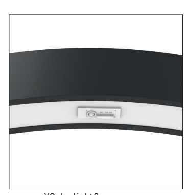
XC daylight&occ sensor

All current index numbers, lumen outputs, power consumption and many other technical information are available in our 2024 pricelist. Details on wireless lighting control systems on page number 896.