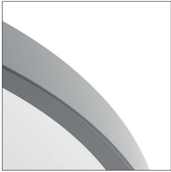
OP opal diffusor